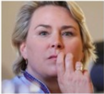
Brussels, Environment minister Céline Fremault

“the people of Brussels are not guinea pigs whose health can be sold at a profit”